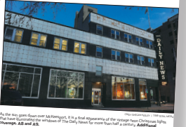
A photo of the building where The Daily News was published for more than a century.